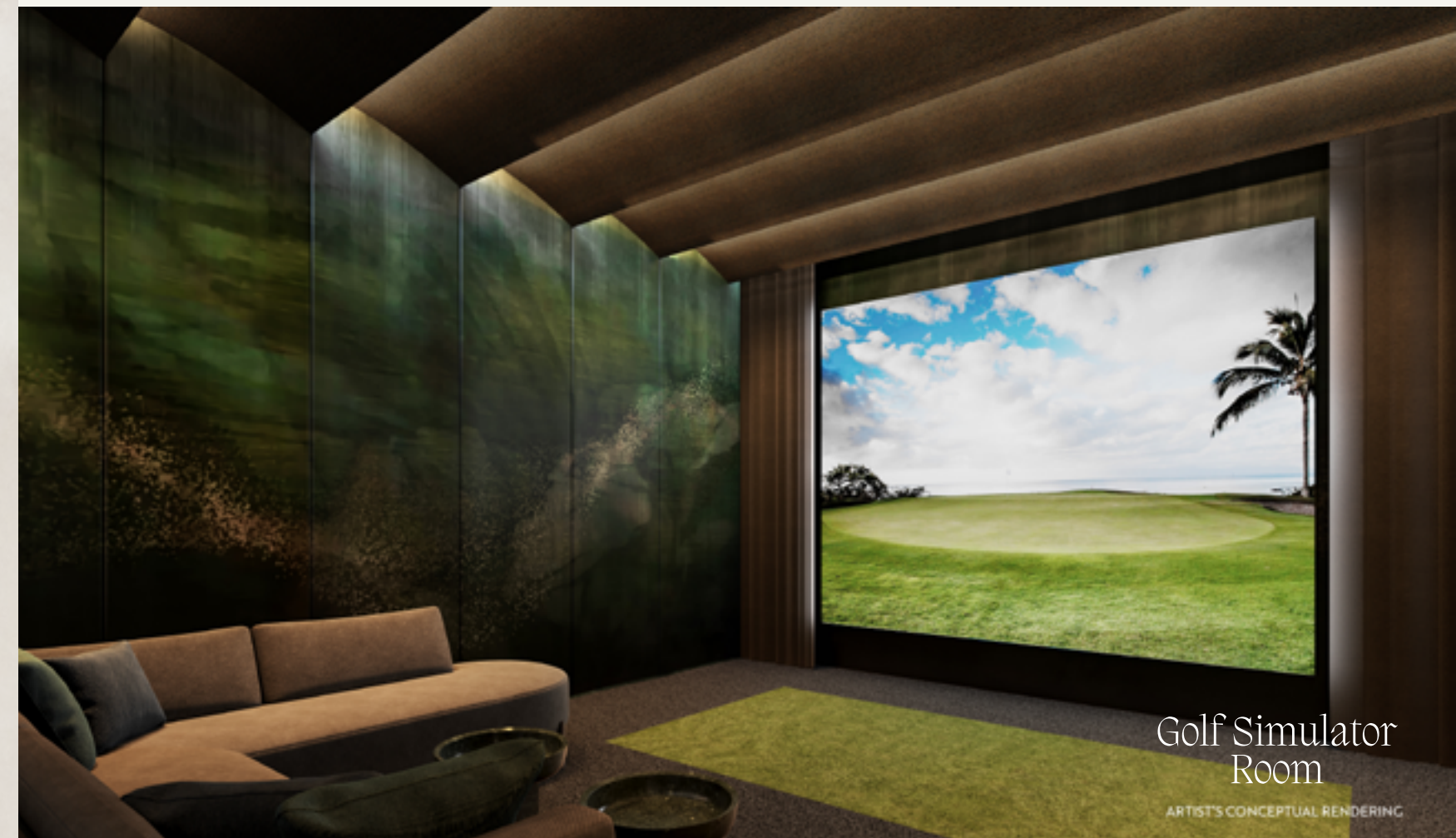
Golf Simulator Room