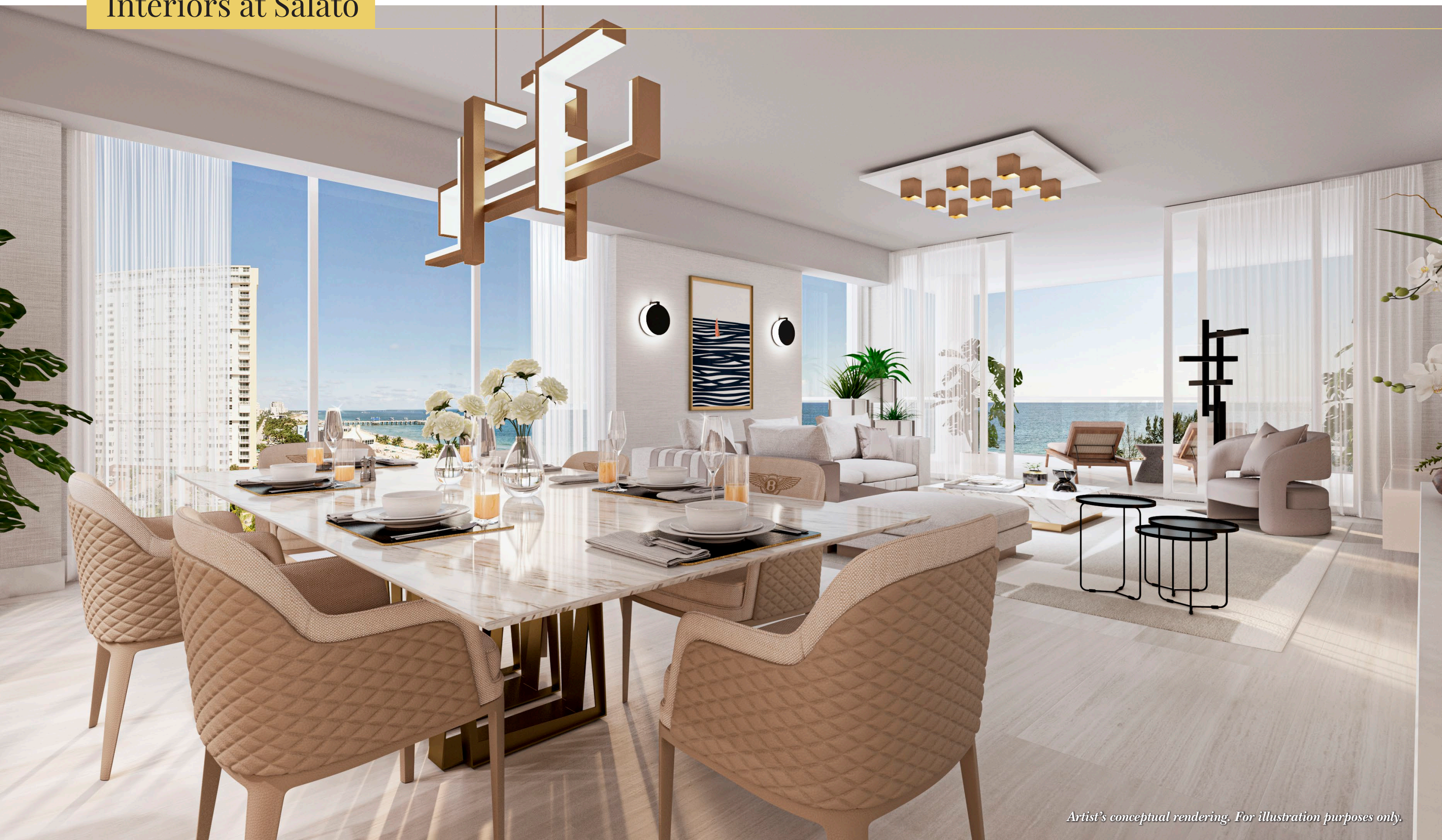
Artist's conceptual rendering. For illustration purposes only.