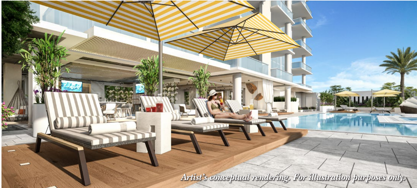
Artist's conceptual rendering. For illustration purposes only.