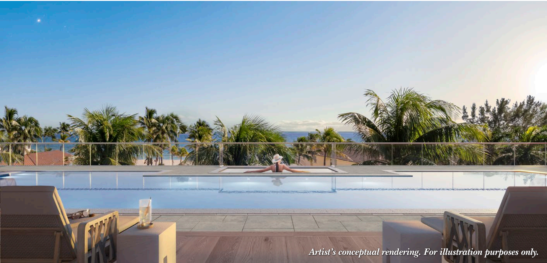
Artist's conceptual rendering. For illustration purposes only.