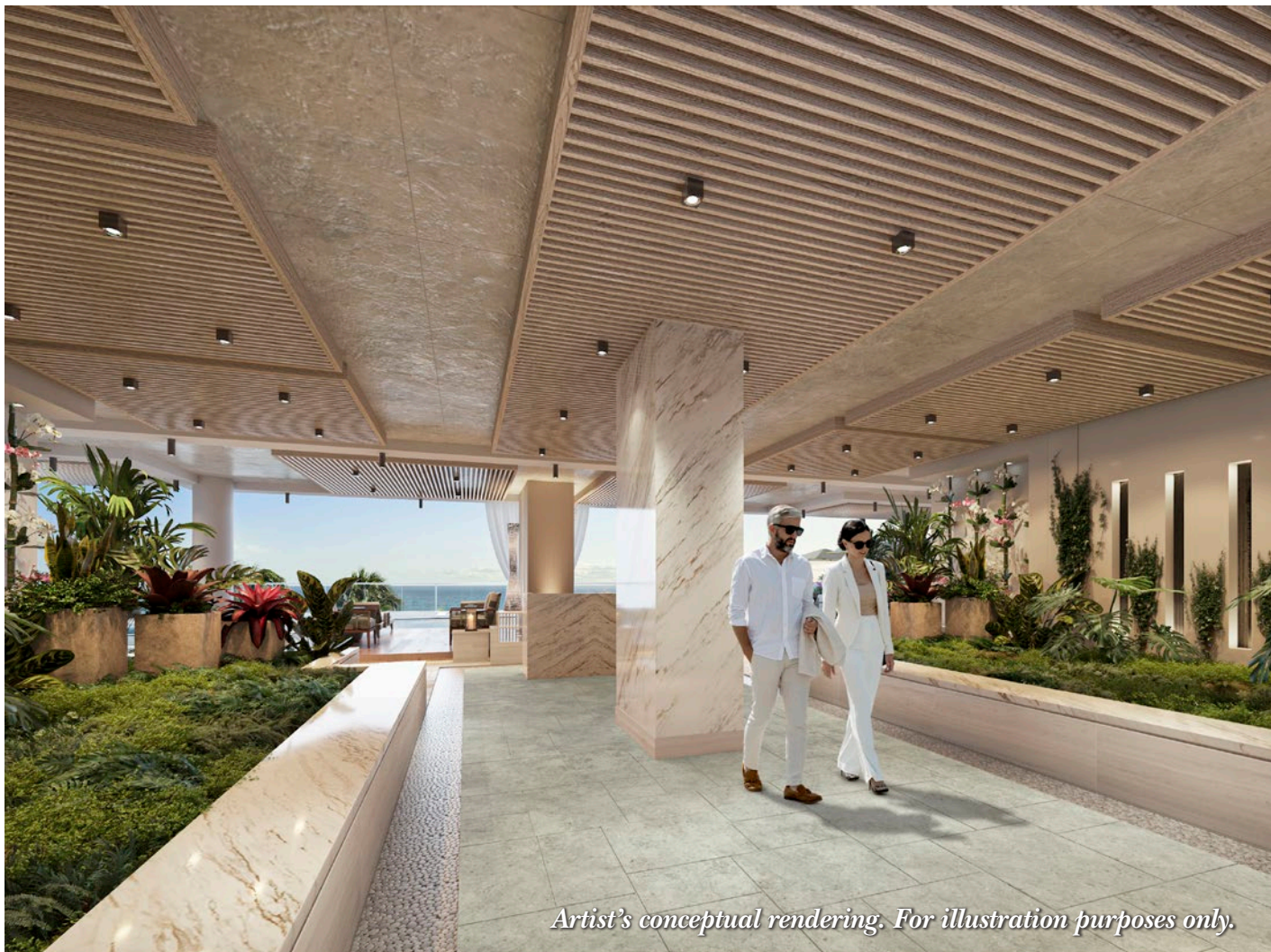
Artist's conceptual rendering. For illustration purposes only.