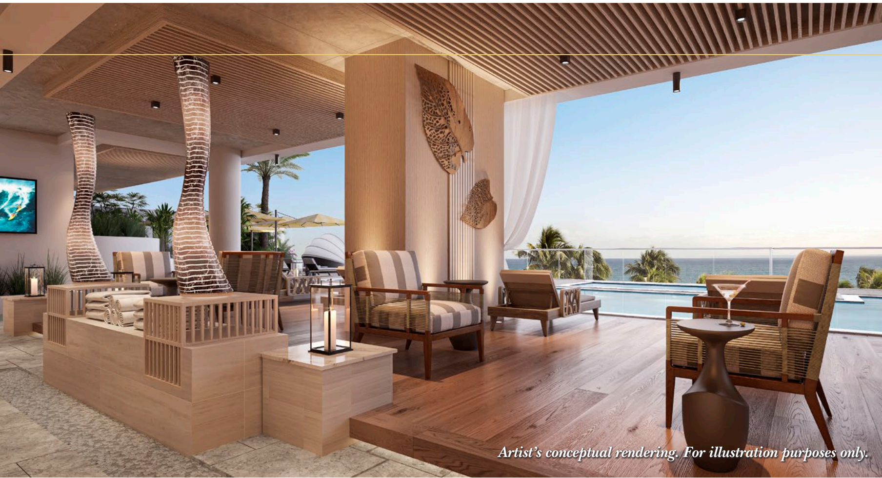
Artist's conceptual rendering. For illustration purposes only.