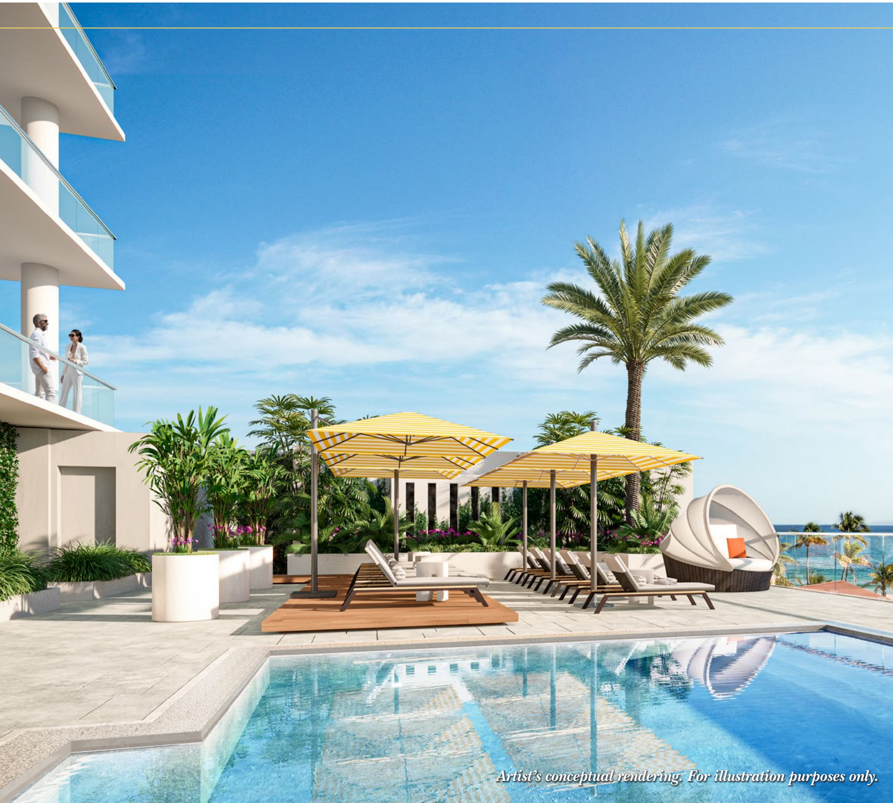
Artist's conceptual rendering. For illustration purposes only.