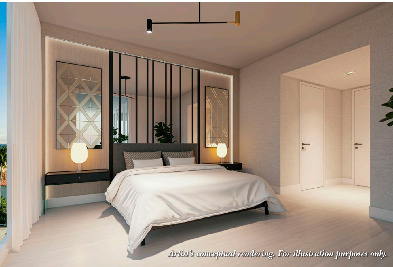
Artist's conceptual rendering. For illustration purposes only.