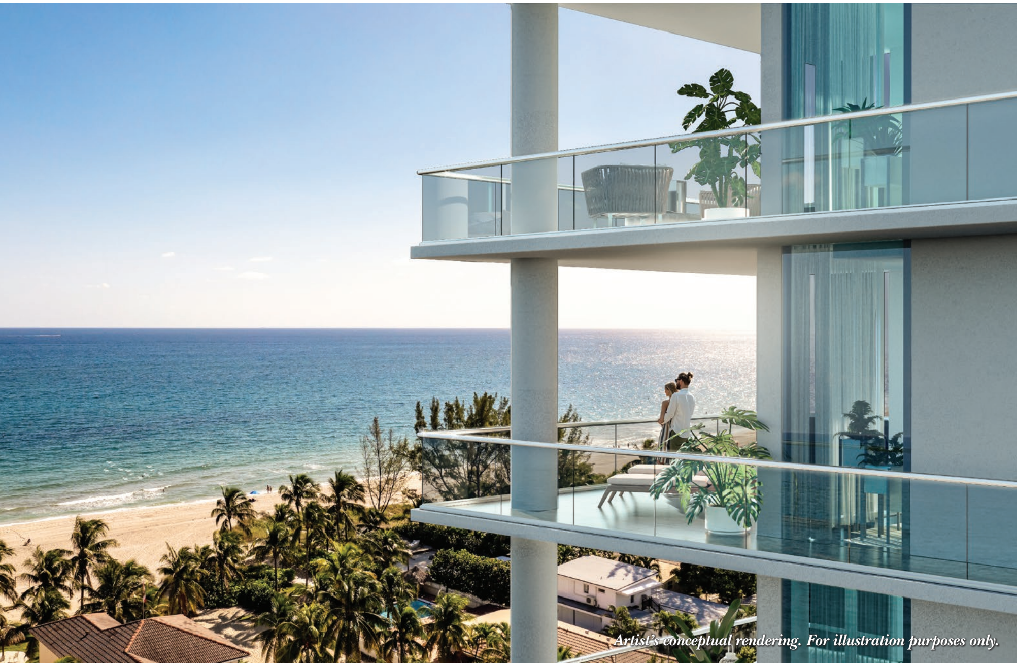
Artist's conceptual rendering. For illustration purposes only.