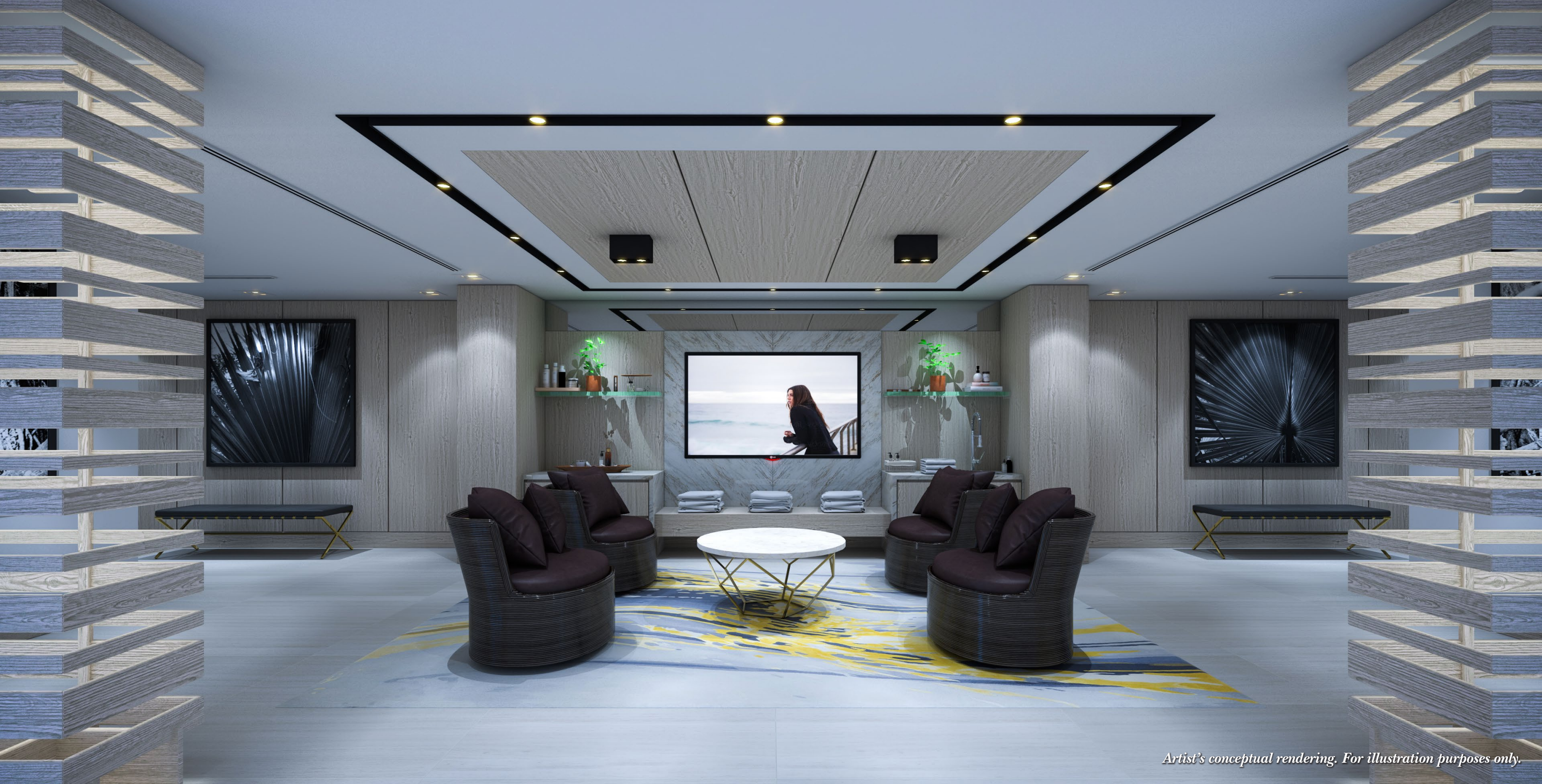
Artist's conceptual rendering. For illustration purposes only.