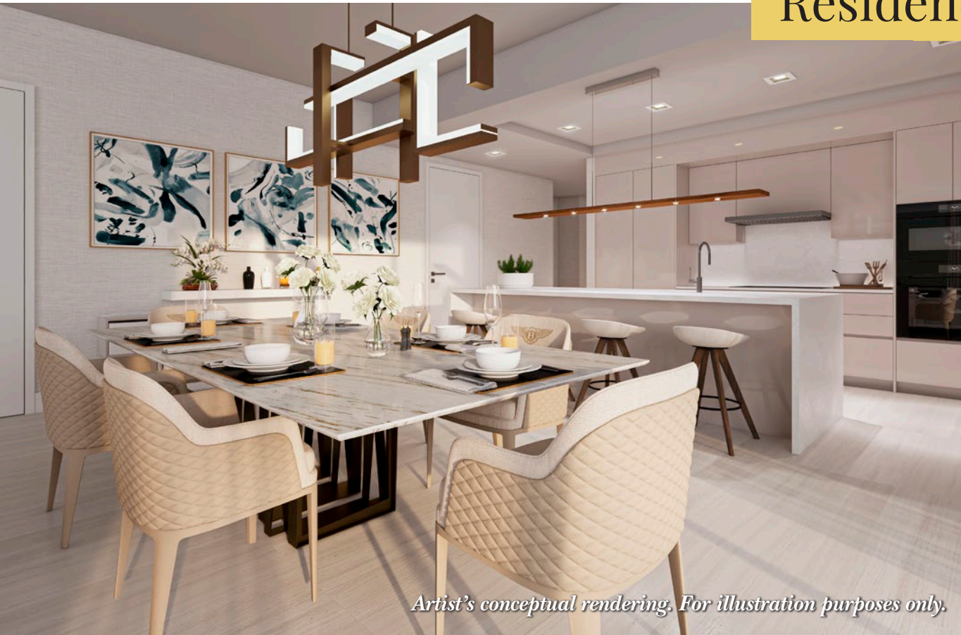
Artist's conceptual rendering. For illustration purposes only.