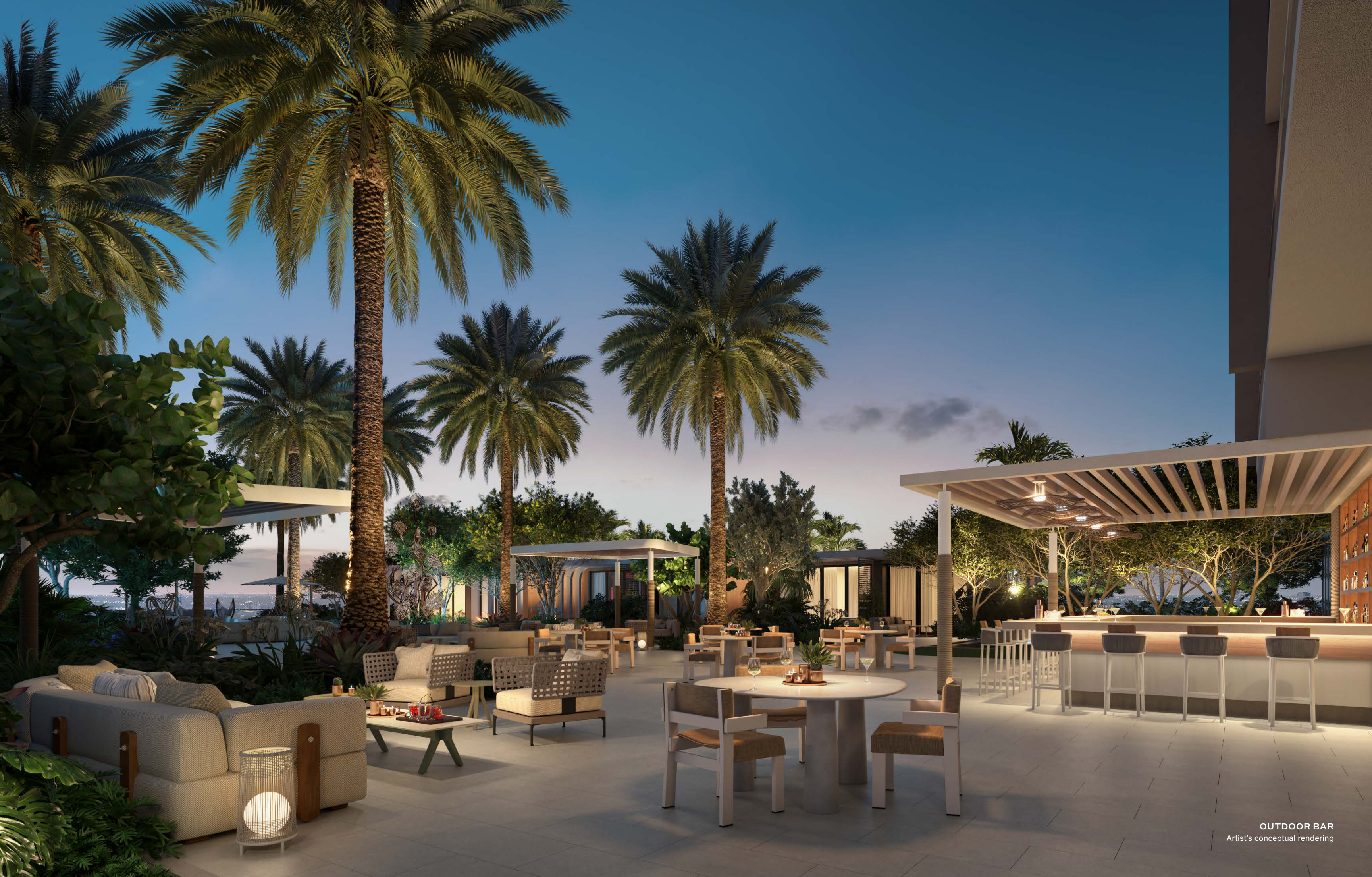
OUTDOOR BAR Artist's conceptual rendering