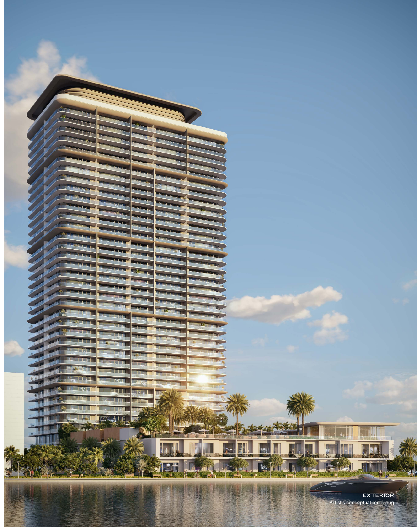
EXTERIOR Artist's conceptual rendering