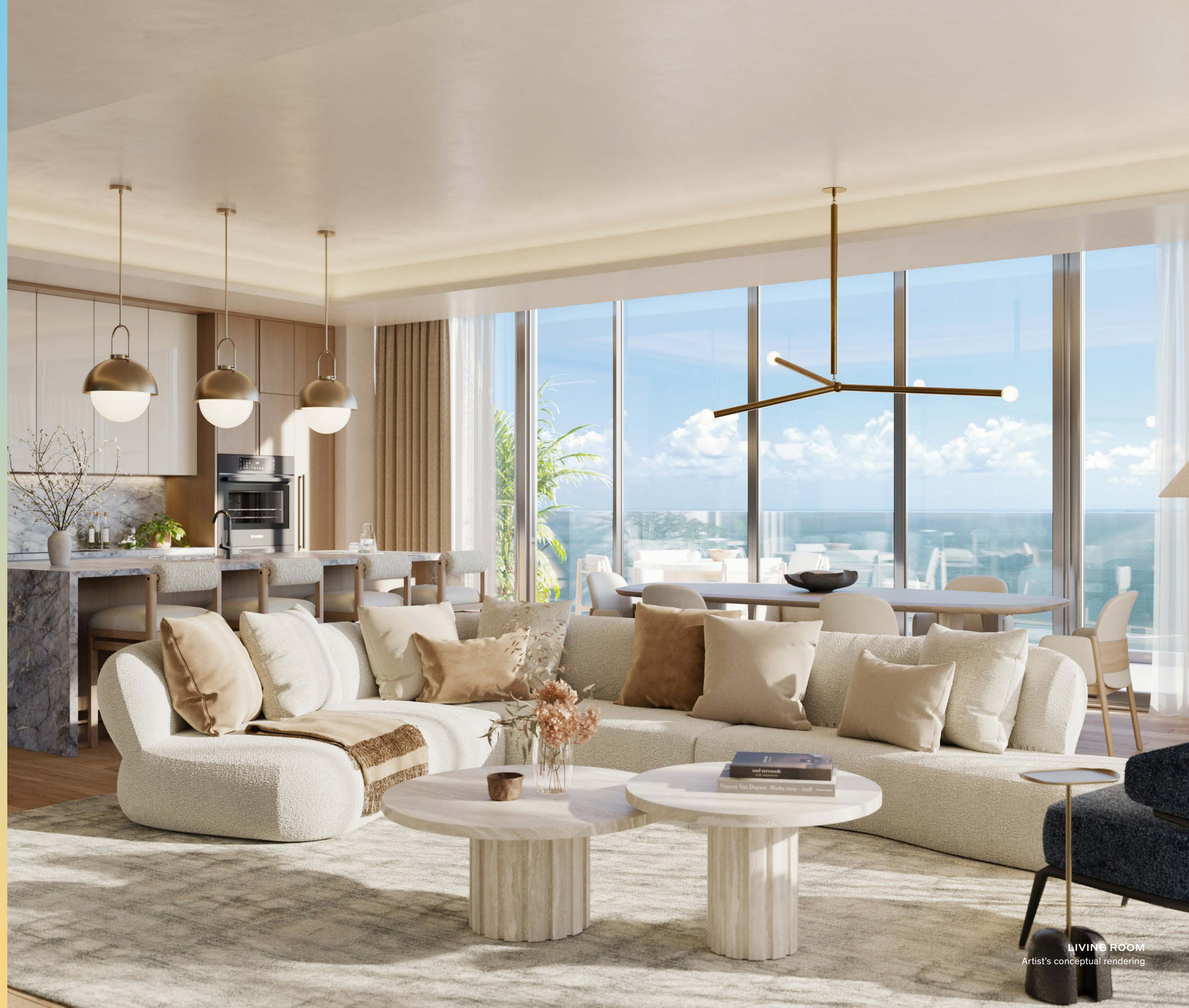
LIVING ROOM Artist's conceptual rendering

Spa-inspired primary baths outfitted with elegant soaking tub and fixtures by Kohler and Hansgrohe