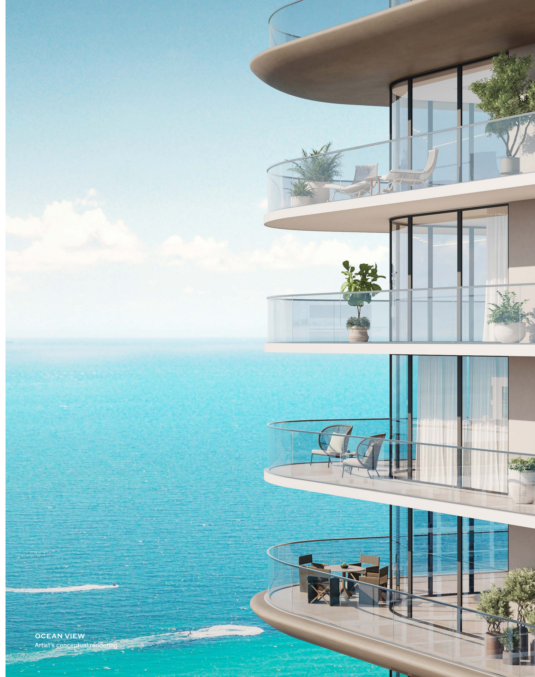
OCEAN VIEW Artist's conceptual rendering

ORAL REPRESENTATIONS CANNOT BE RELIED UPON AS CORRECTLY STATING REPRESENTATIONS OF THE DEVELOPER. FOR CORRECT REPRESENTATIONS, MAKE REFERENCE TO THIS BROCHURE AND TO THE DOCUMENTS REQUIRED BY SECTION 718.503, FLORIDA STATUTES, TO BE FURNISHED BY A DEVELOPER TO A BUYER OR LESSEE.