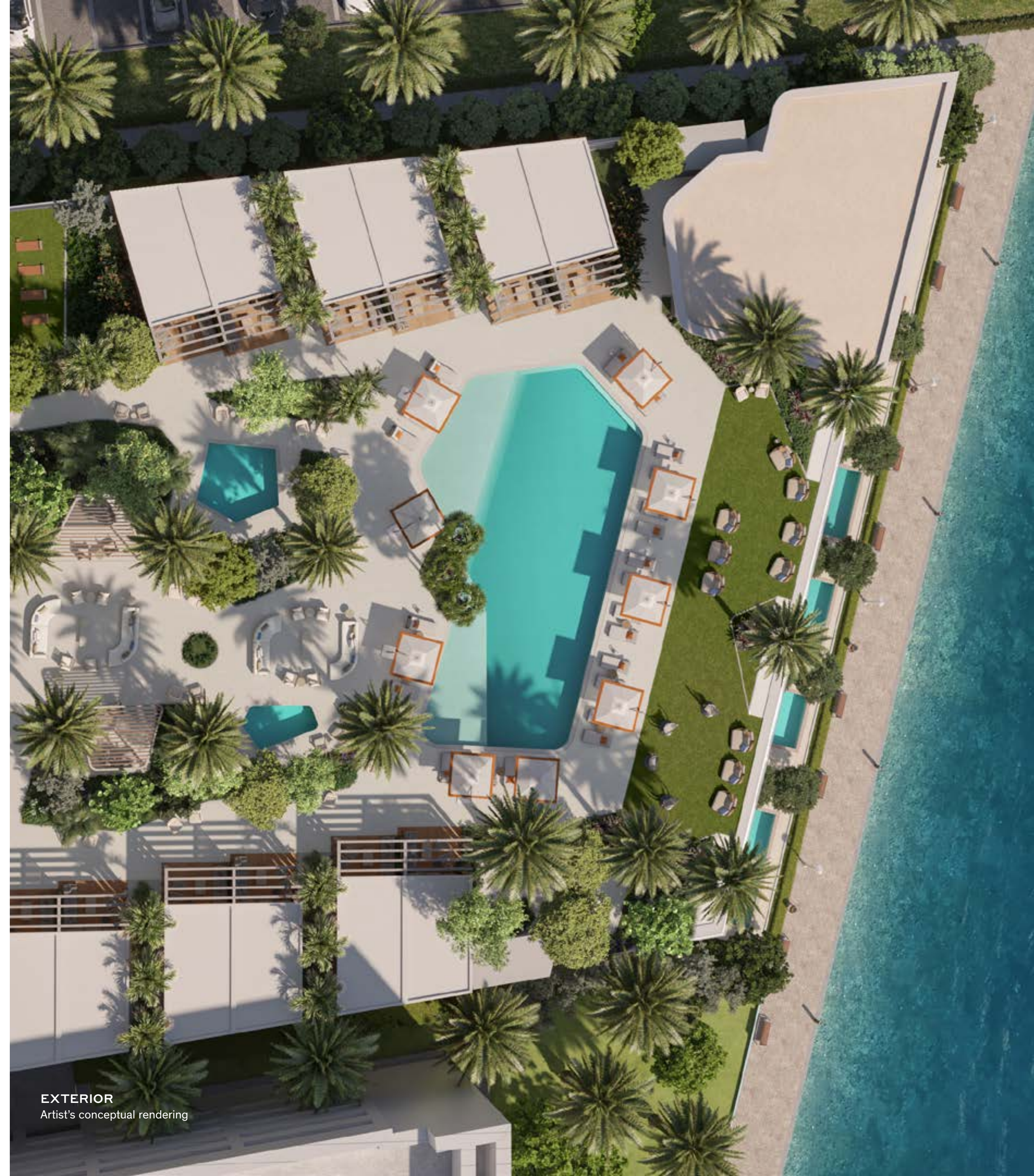
EXTERIOR Artist's conceptual rendering

20% Due at Contract 20% Due at Groundbreaking 10% Due at Top-off 50% Due at Closing