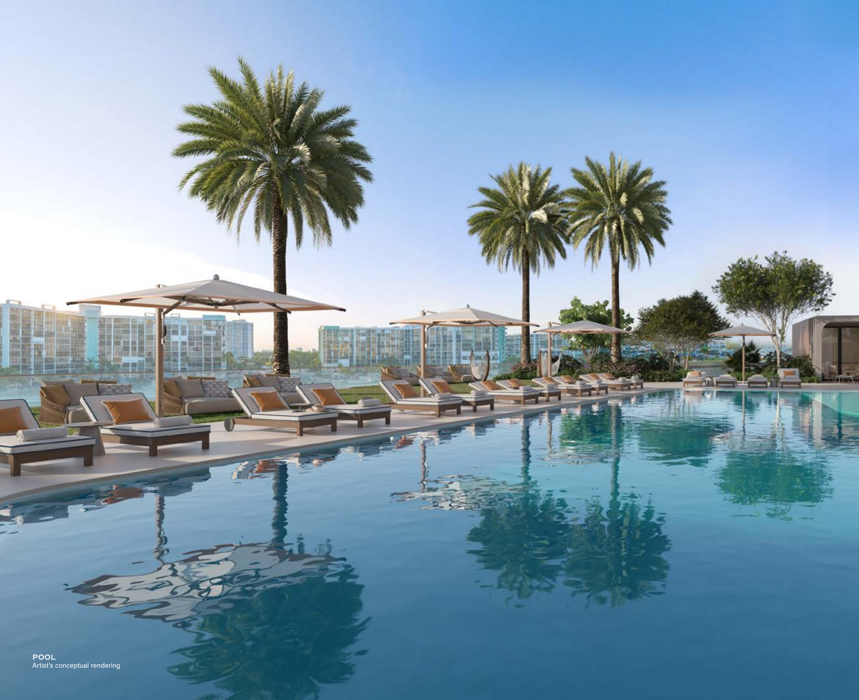
POOL Artist's conceptual rendering