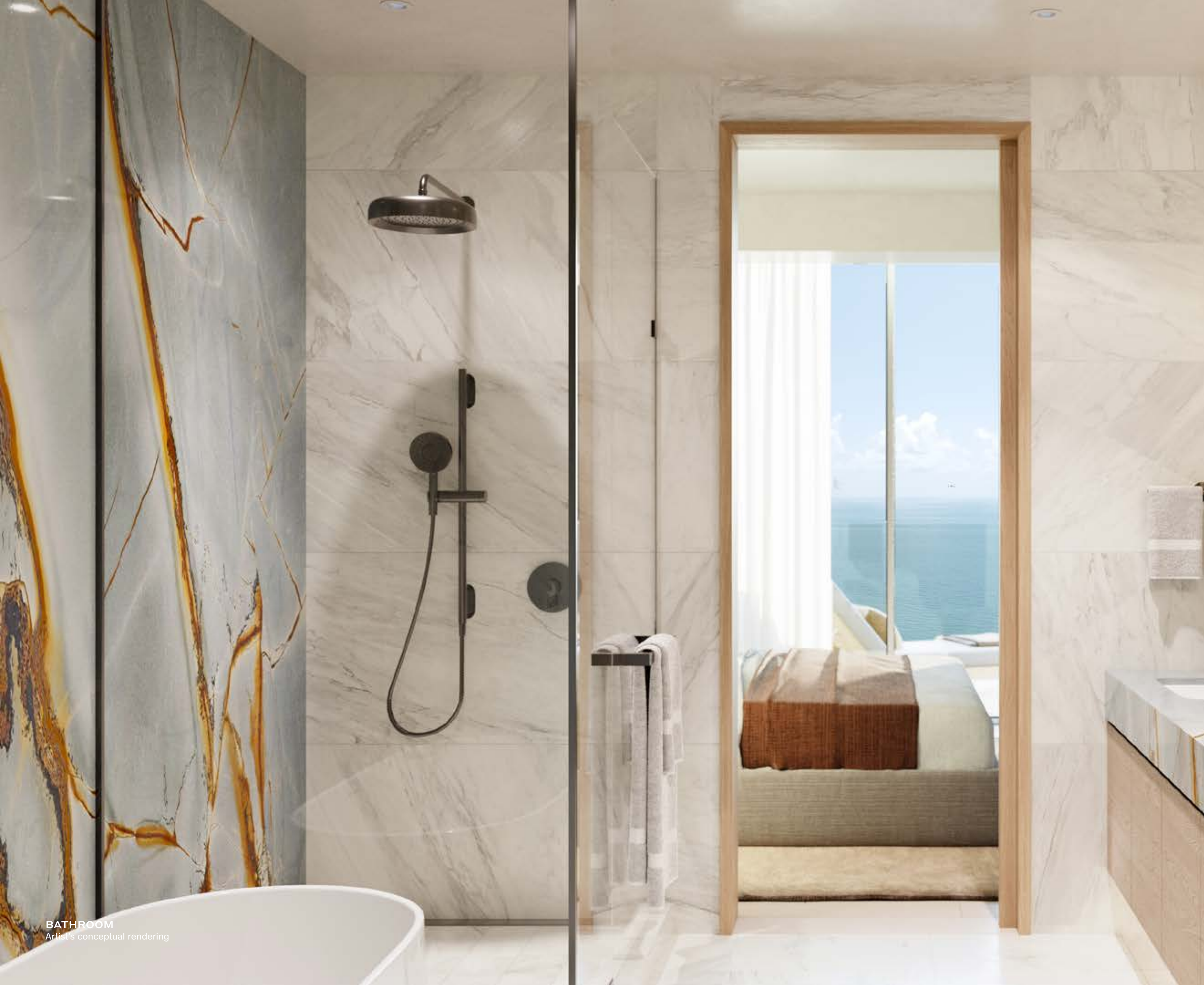
BATHROOM Artist's conceptual rendering