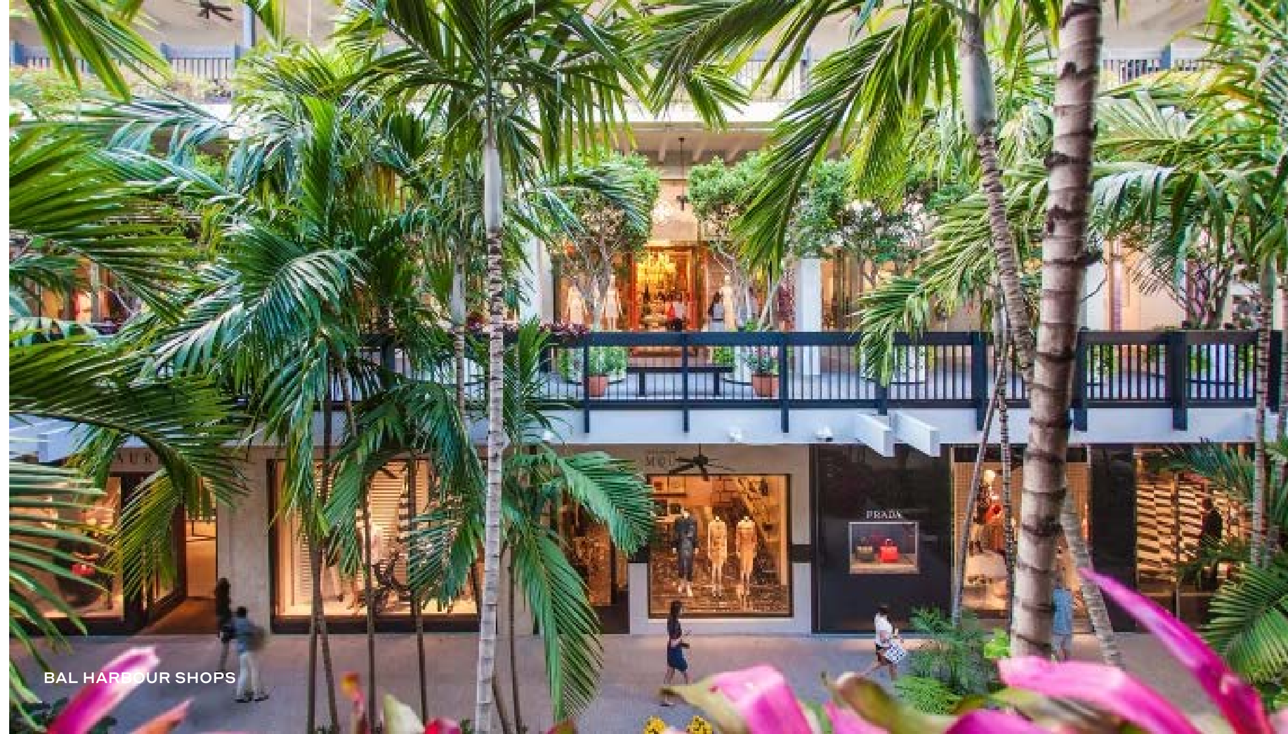
BAL HARBOUR SHOPS

One-of-a-kind waterpark and outdoor experience, located at the JW Marriott Turnberry Resort & Spa.