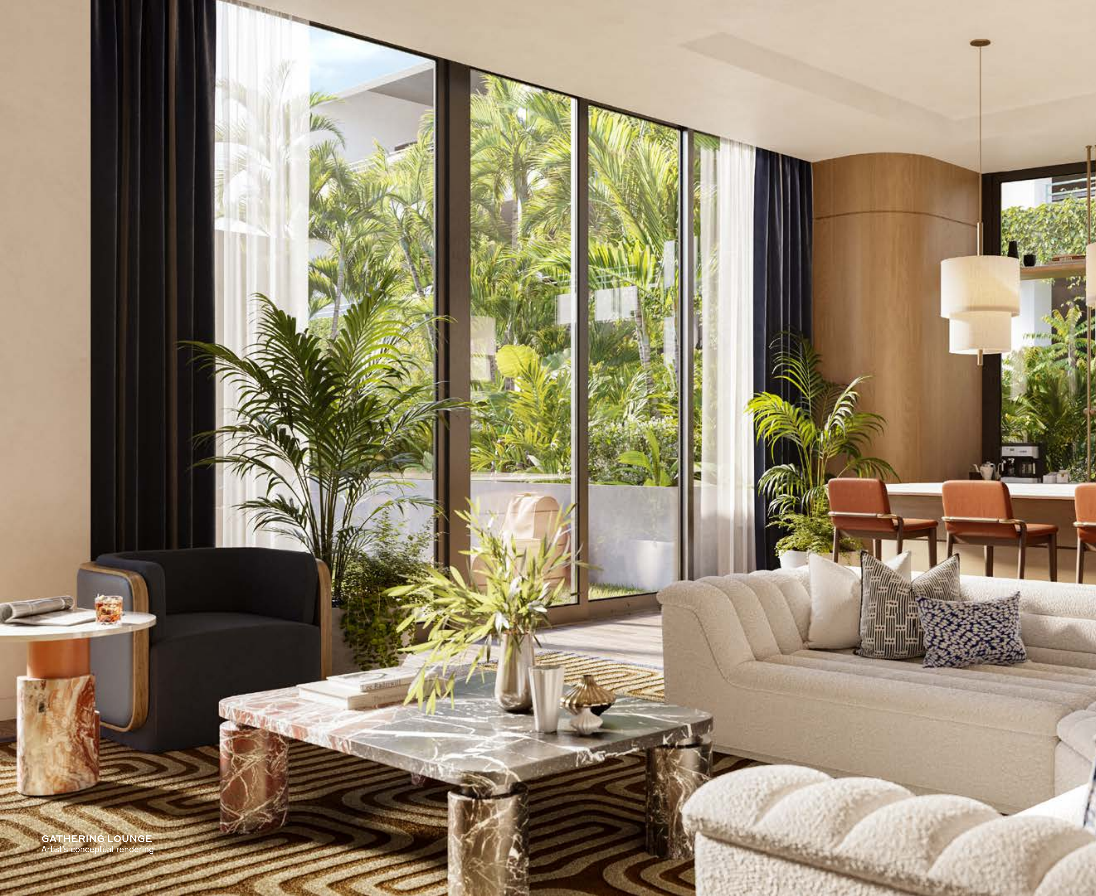
GATHERING LOUNGE Artist's conceptual rendering