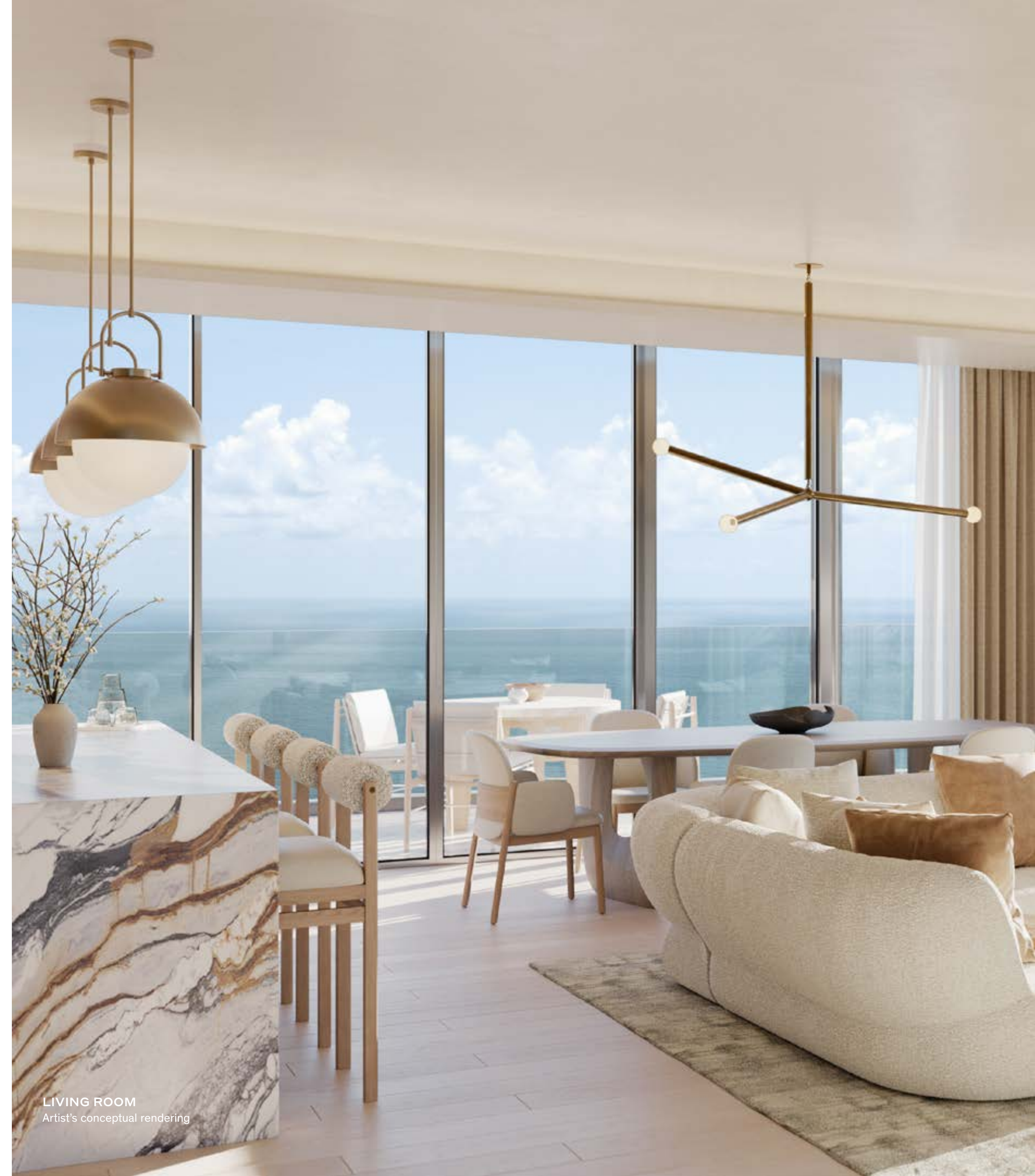
LIVING ROOM Artist's conceptual rendering

Interiors by Meyer Davis are graced with incredible water views and defined by discreet luxury, iconic design, clean, fluent lines, and striking textures—lending a carefree, refined sensibility to each and every space.