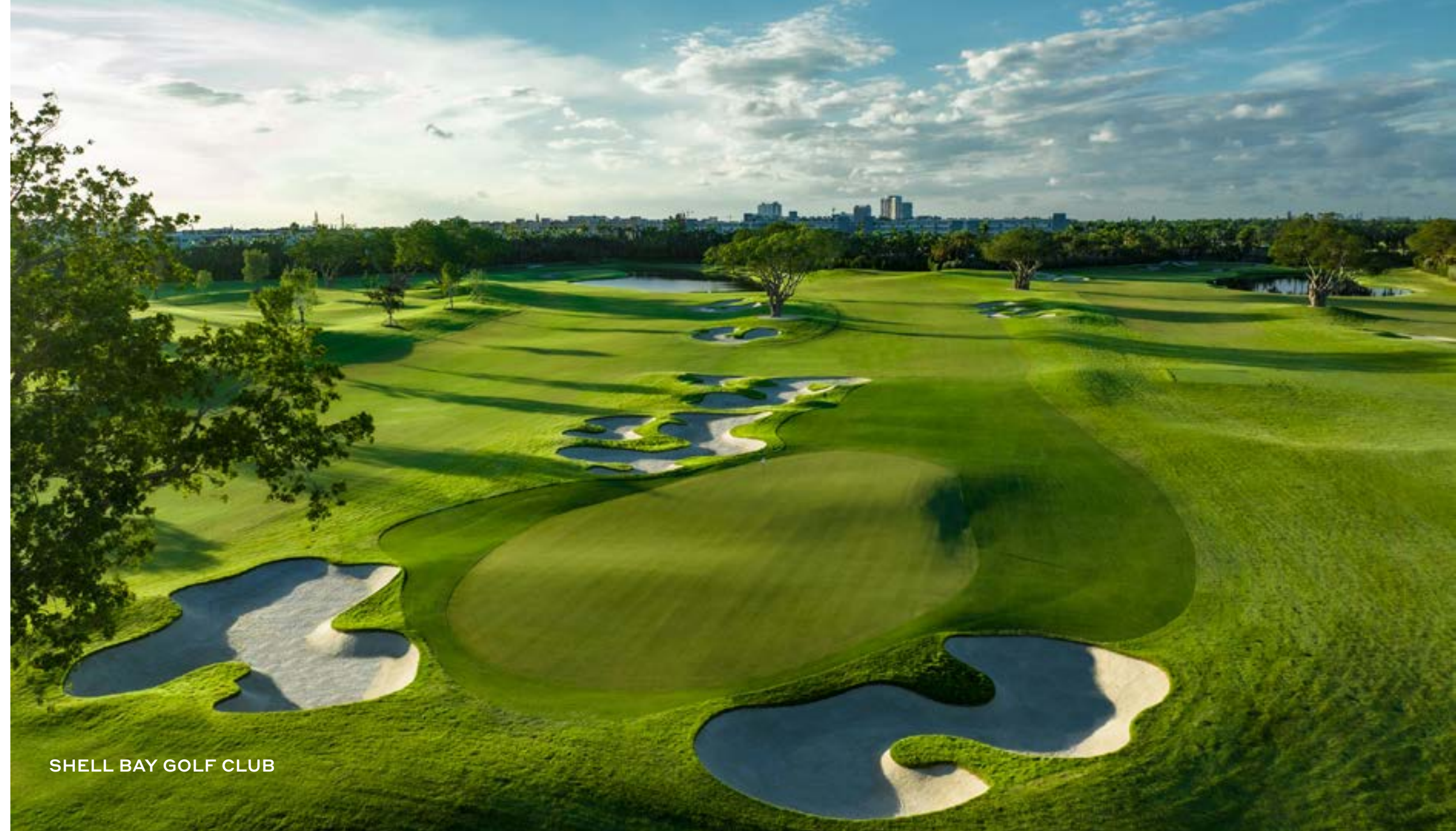
SHELL BAY GOLF CLUB