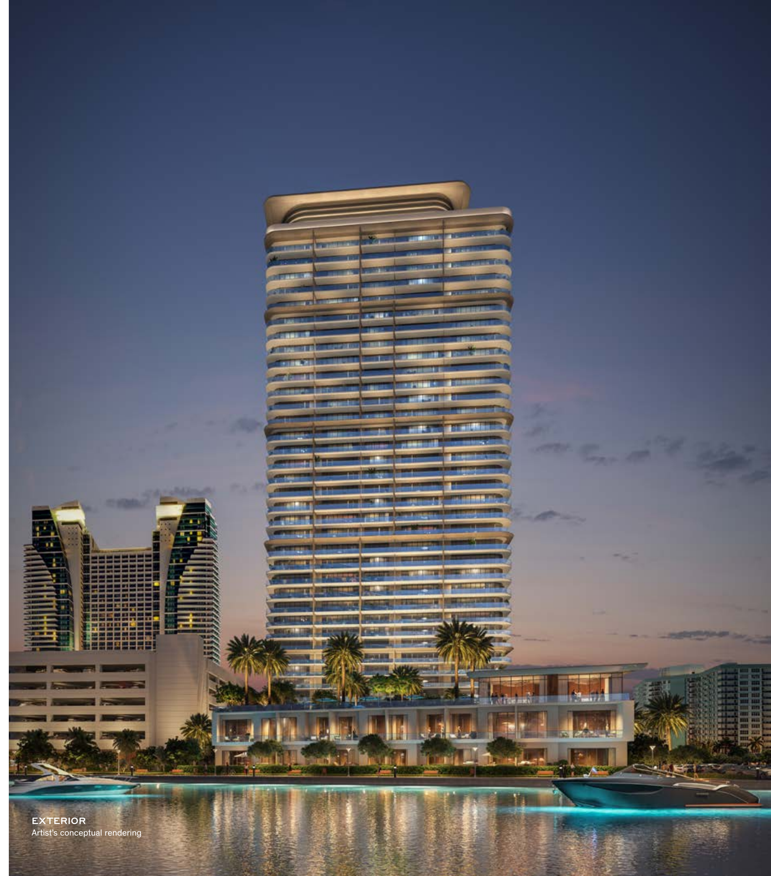
EXTERIOR Artist's conceptual rendering