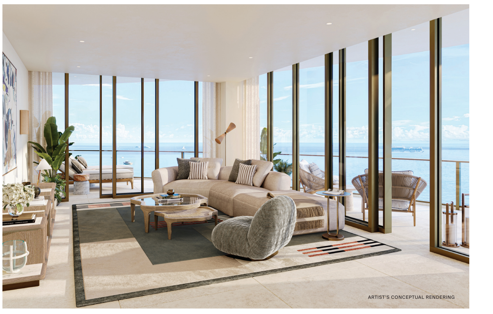
SWEEPING VIEWS OF THE BAY AND THE OCEAN ARE TRULY RESTORATIVE