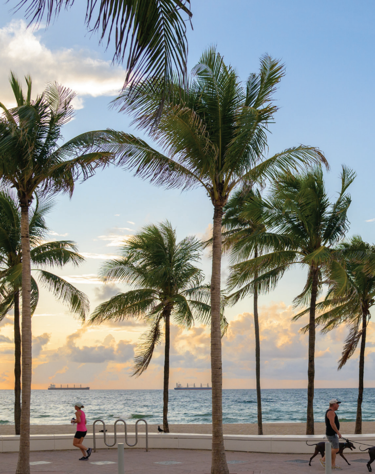
FORT LAUDERDALE OFFERS A BALANCE OF LAID-BACK BEACH LIFESTYLES AND VIBRANT URBAN ACTIVITIES

YOUR WATERFRONT LIFE, WHERE POOLS MEET YACHTS