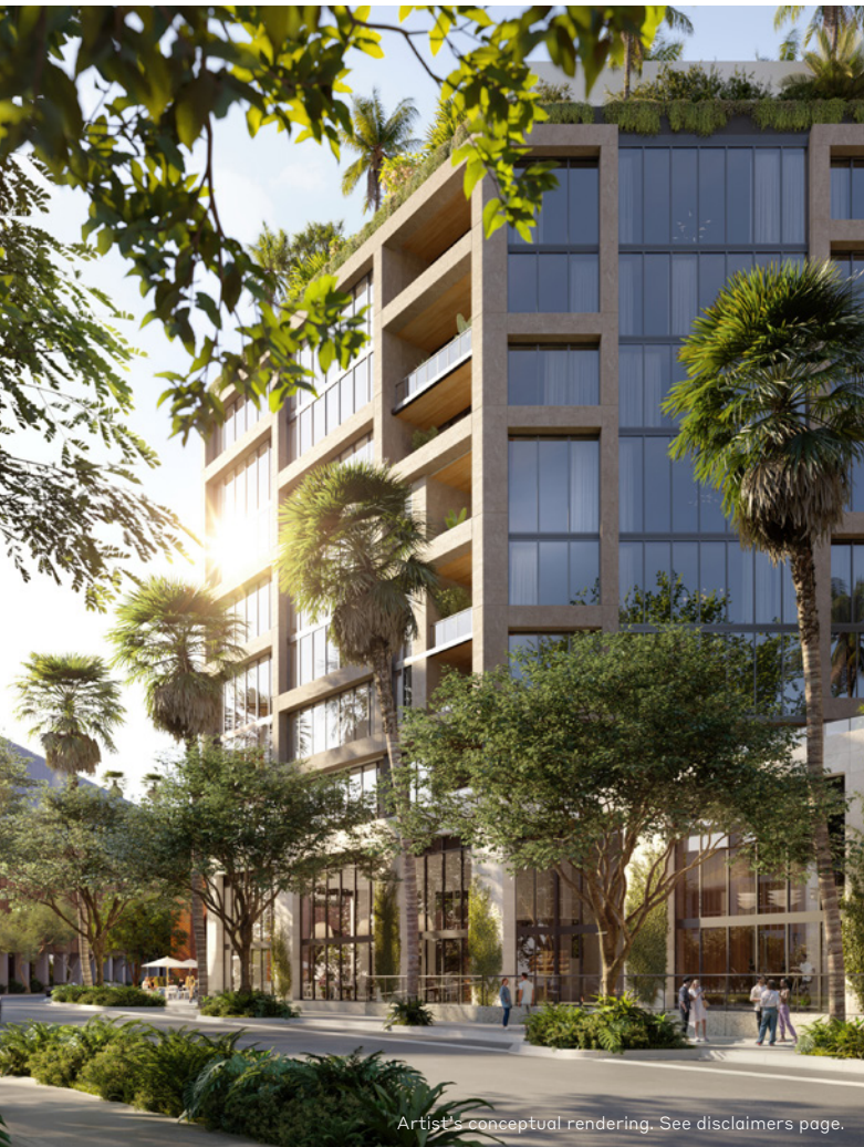
Artist's conceptual rendering. See disclaimers page.